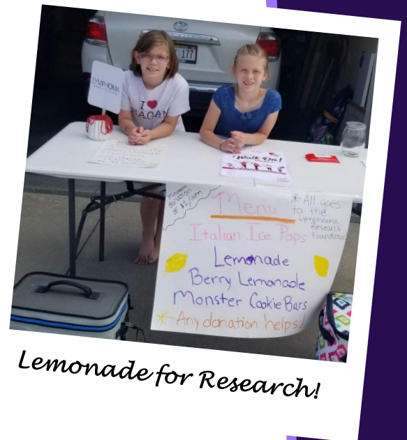
Lemonade for Research!

Secrets to Success: Who can resist a homemade glass of lemonade to support cancer research?