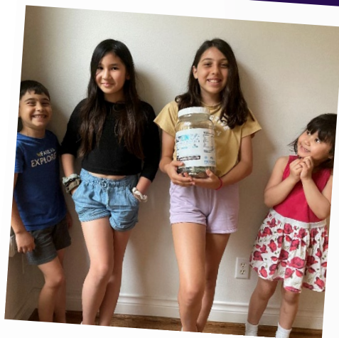
The Money Jar Club